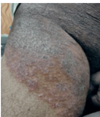
Figure 1. Tinea Corporis